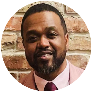
Mighty Fine Reflection and Rejuvenation: Exploring Public Health Workforce Development Needs

The theme of the 2022 Annual Conference was “Public Health Rising: Renew and Recharge.” This theme signaled an opportunity to hit the reset button and focused on tools public health professionals could use to move forward during these challenging times with session topics including workforce development, leadership skills, resilience, and stress management.